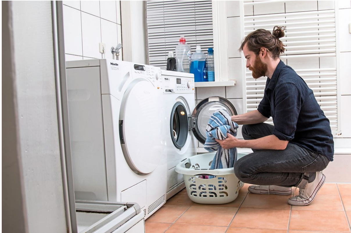
Rainwater can also be used at home, for example for washing clothes or flushing the toilet.

You can get these tanks in a range of sizes, starting with a 1,000l-1,500l capacity, says Henze. His advice is to assume you'll need a tank of about 1,500l to water an area of 100sq m.