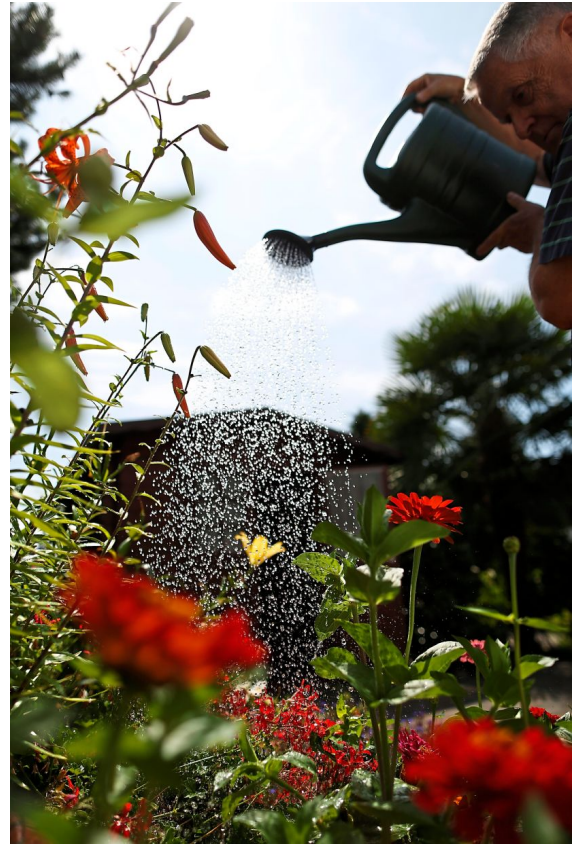
Environmentalists have long campaigned for people to use rainwater rather than drinking water when watering the plants in the garden.

5 questions to ask yourself before growing an indoor water garden